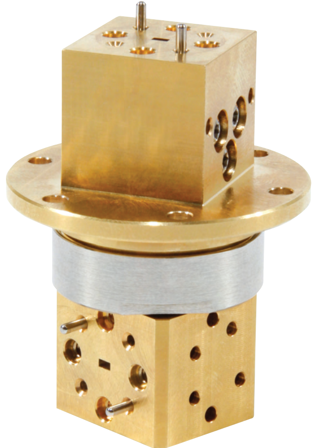
The 94GHz rotary joints will be used to help detect obstacles on roads during severe fogs.

SPINNER's engineers were faced with the complex task of technically implementing the radiofrequency concept. Their aim was to create a broad-band, power-stable and voltage-proof rotary joint that could meet the highest mechanical demands despite being the smallest possible size. Its lifetime of at least 100 million rotations (even under extreme temperatures) and its transferable-pulse peak power of at least 250W are also worth mentioning.